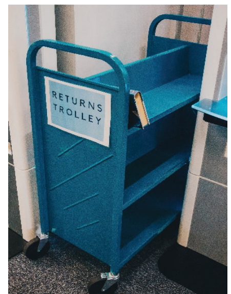
Or the returns trolley