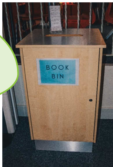
The book bin